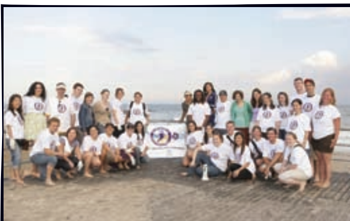
The Barefoot Wine Beach Rescue Project at Rockaway Beach.